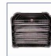
Type C (Optional for 45/60/80L)