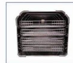
Type C(Optional for 45/80L)