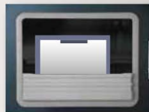
Bin is outside the door.