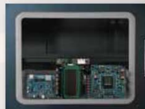
Bin is inside the door.

Bins can be installed or replaced within 10 seconds. Maximum loading of bin: 5kgs