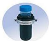
50ml x 4pcs (plastic)