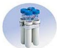
15ml x 16pcs