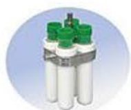
15ml x 16pcs