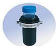
50ml x 4pcs (plastic)