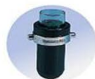
50ml x 4pcs (glass)