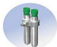
15ml x 8pcs