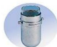
100ml x 4pcs