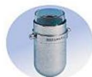
100ml x 4pcs