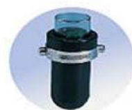
50ml x 4pcs (glass)