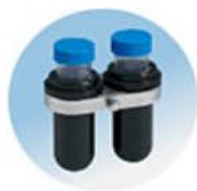
50ml x 8pcs (plastic)