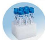
15ml x 40pcs (plastic)