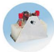
6ml x 56pcs