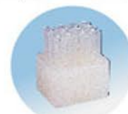
15ml x 48pcs