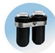
50ml x 8pcs (glass)