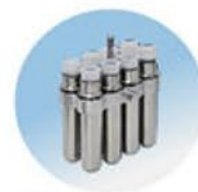
15ml x 32pcs