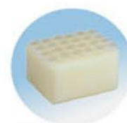
1.5ml x 96pcs