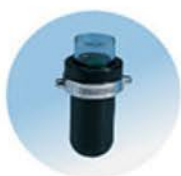
50ml x 4pcs (glass)