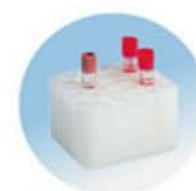
6ml x 112pcs