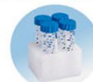
50ml x 16pcs (plastic)