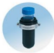
50ml x 4pcs (plastic)