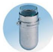
100ml x 4pcs