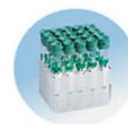
10ml x 80pcs