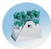
10ml x 48pcs