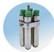
15ml x 16pcs