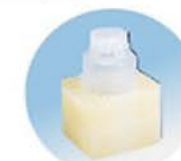
250ml x 4pcs