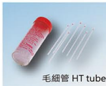
毛細管 HT tube

讀板、毛細管另購 ● Reader and HT tubes not included.